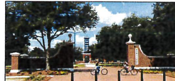
The East Gate at Heritage Park is one of the latest improvement projects completed in downtown Foley. The gate and nearby extension of East Jessamine Avenue were finished in May.

Foley Main Street operates as a nonprofit with a volunteer board dedicated to increasing the economic vibrancy of the area. Its primary focus is boosting awareness of downtown and strengthening new and existing businesses. For more information, visit www.foleymainstreet.com .