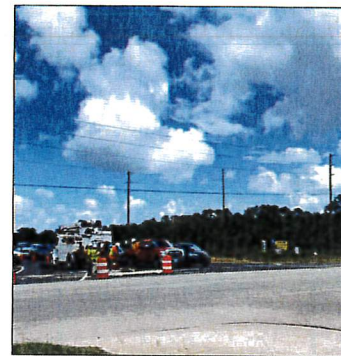
Traffic is moving again at Baldwin County 12 and Alabama 59 after detours that lasted several months. Work is continuing on the state project to improve the intersection.

More information is available online at www.dot.state.al.us .