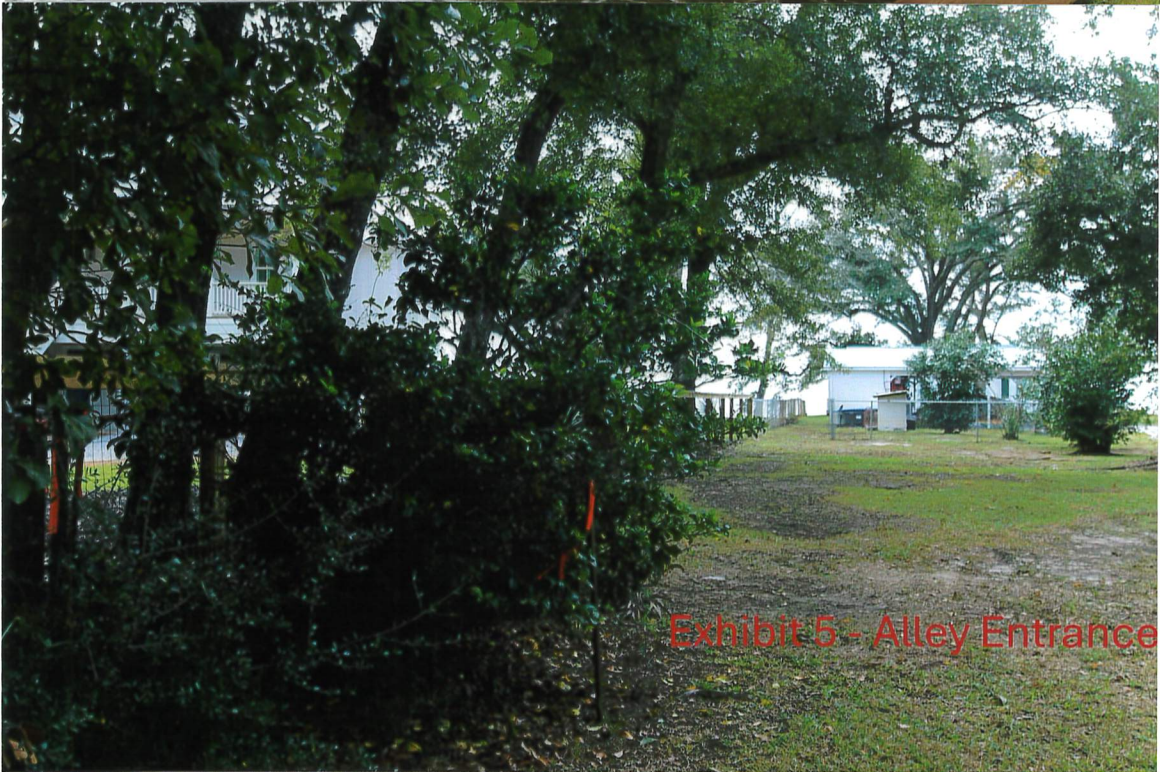
Exhibit 5 - Alley Entrance