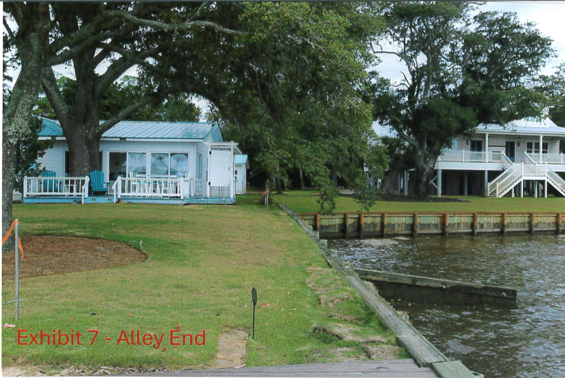
Exhibit 7 - Alley End