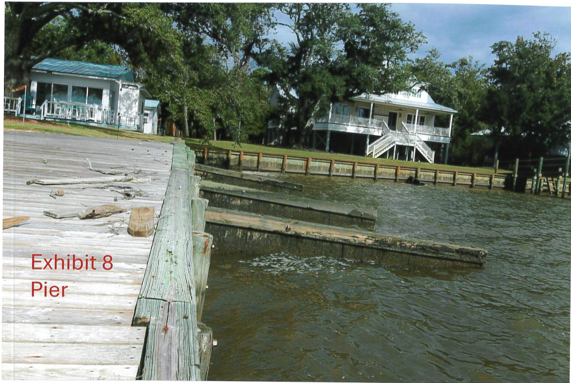
Exhibit 8 Pier