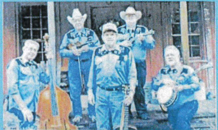
Unknown Bluegrass Band