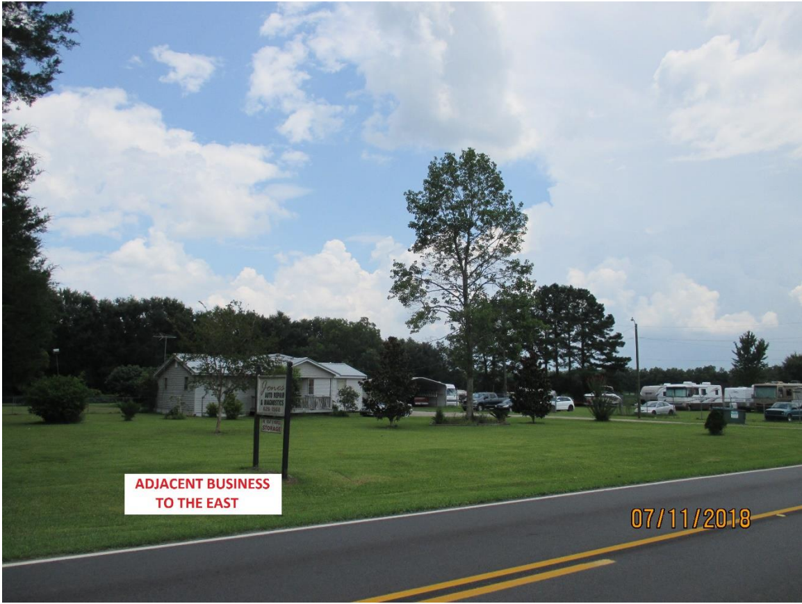
ADJACENT BUSINESS TO THE EAST