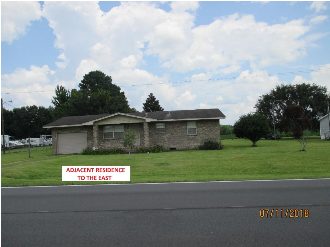
ADJACENT RESIDENCE TO THE EAST