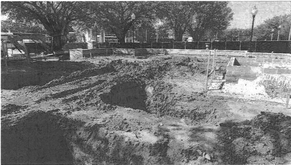
Photo 3 - Site conditions