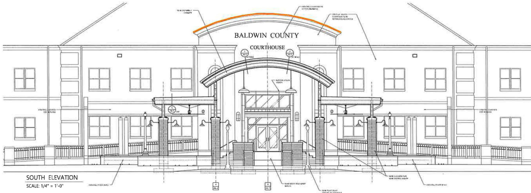
SOUTH ELEVATION SCALE: 1/4" = 1'-0"