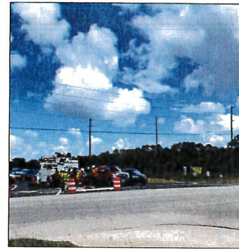
Traffic is moving again at Baldwin County 12 and Alabama 59 after detours that lasted several months. Work is continuing on the state project to improve the intersection.

More information is available online at www.dot.state.al.us .