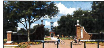
The East Gate at Heritage Park is one of the latest improvement projects completed in downtown Foley. The gate and nearby extension of East Jessamine Avenue were finished in May.

Foley Main Street operates as a nonprofit with a volunteer board dedicated to increasing the economic vibrancy of the area. Its primary focus is boosting awareness of downtown and strengthening new and existing businesses. For more information, visit www.foleymainstreet.com .