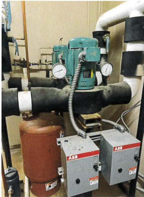
Chilled Water Pumps CWP-1 and CWP-2