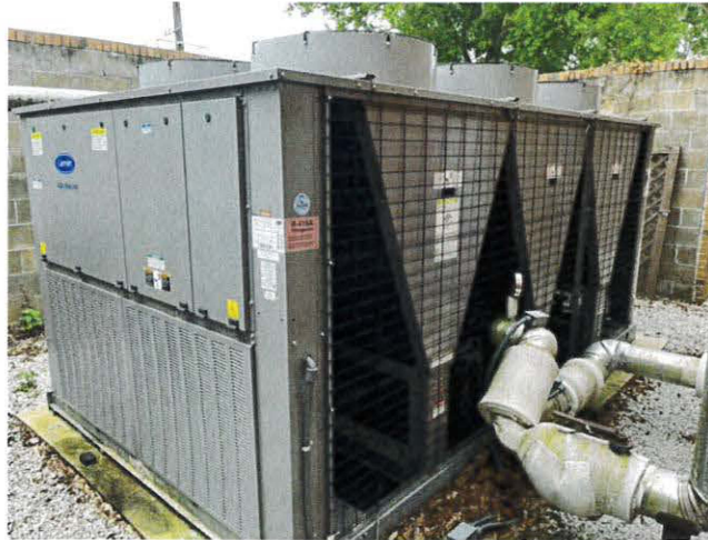
Air Cooled Chiller