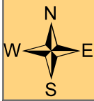
EXHIBIT A - BALDWIN BEACH EXPRESS SOUTH OF I-10 TO FBE