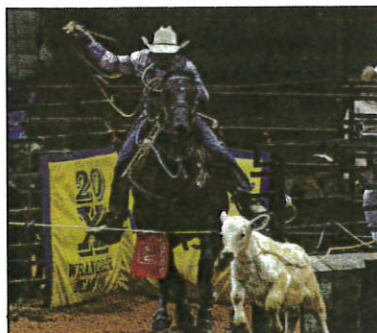
DAY 65: Jennifer Claire Moore Foundation Professional Rodeo

76. Gulf State Park Pier. For $2 a person you can stroll along this 1,540 foot long pier, the second longest pier on the Gulf of Mexico. Take in the view, watch anglers bring in their catch and enjoy the day.