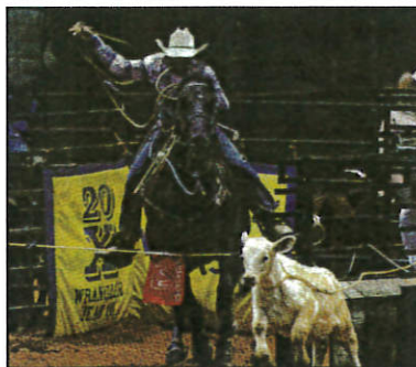
DAY 65: Jennifer Claire Moore Foundation Professional Rodeo

76 Gulf State Park Pier - For $2 a person you can stroll along this 1,540 foot long pier, the second longest pier on the Gulf of Mexico. Take in the view, watch anglers bring in their catch and enjoy the day.