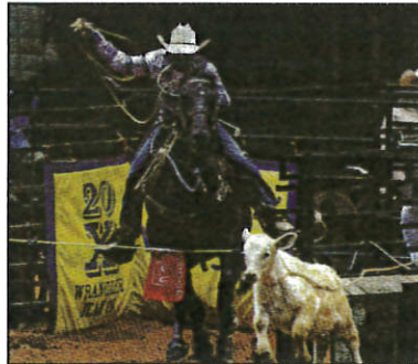
DAY 65: Jennifer Claire Moore Foundation Professional Rodeo

76 Gulf State Park Pier - For $2 a person you can stroll along this 1,540 foot long pier, the second longest pier on the Gulf of Mexico. Take in the view, watch anglers bring in their catch and enjoy the day.