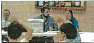
summer of learning gun safety. Attendees of