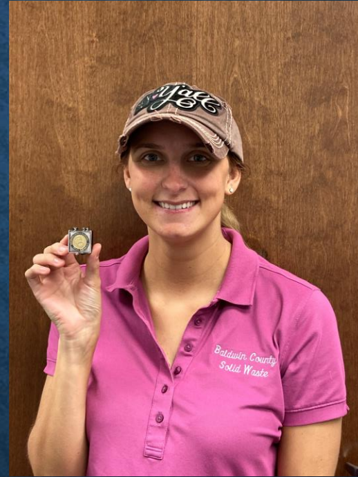
Blakely Hall, Solid Waste