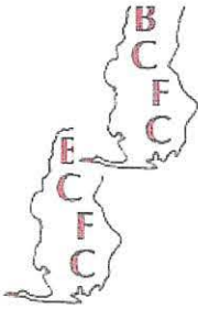
Exhibit B to Resolution #2021-035