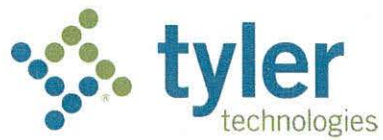
Exhibit A Investment Summary

The following Investment Summary details the software, products, and services to be delivered by us to you under the Agreement. This Investment Summary is effective as of the Effective Date. Capitalized terms not otherwise defined will have the meaning assigned to such terms in the Agreement.