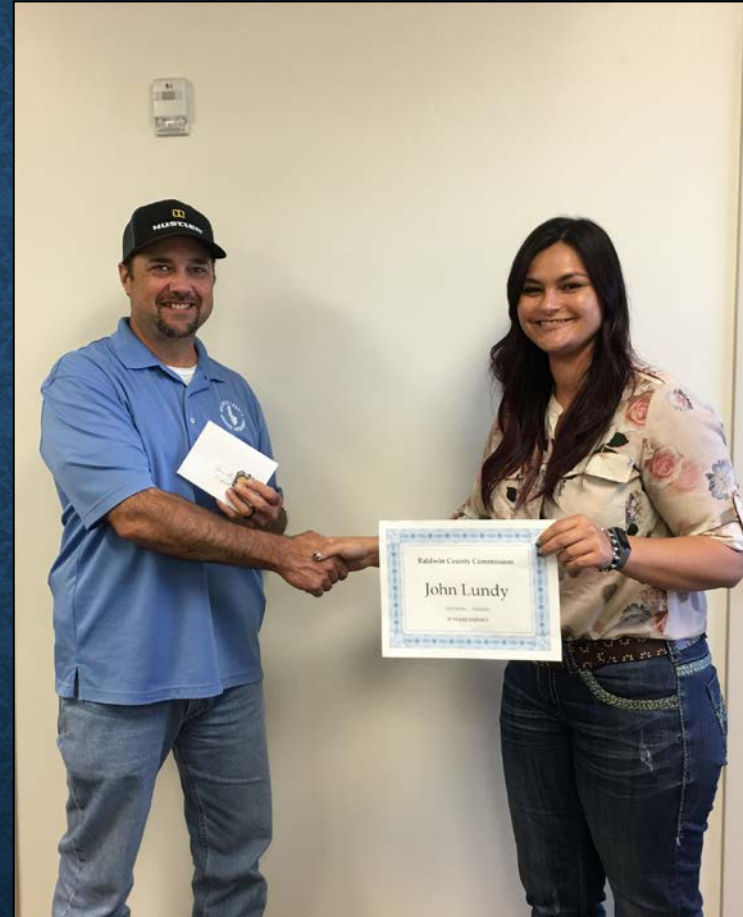
John Lundy Highway