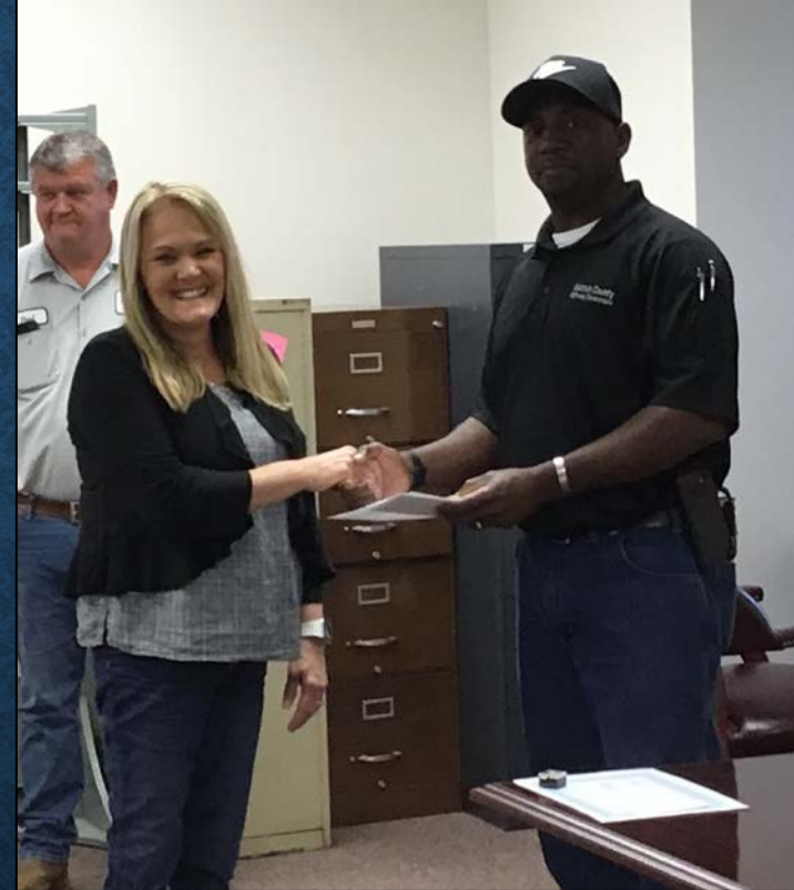
Tammy Monte Highway