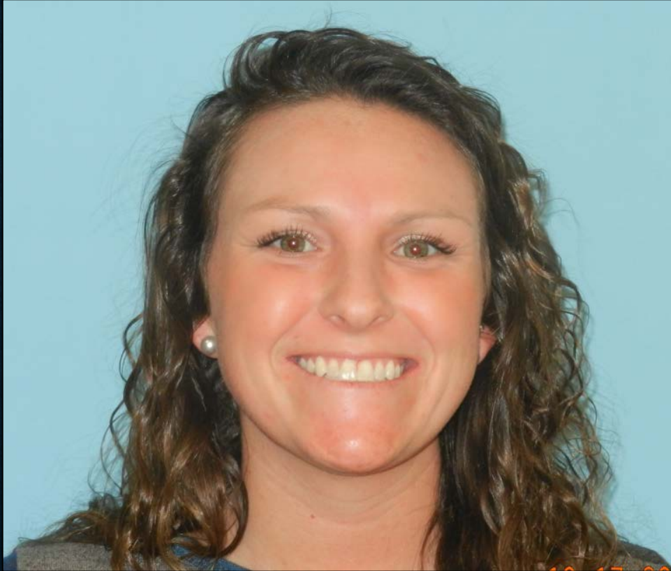
Holley Byrd Highway