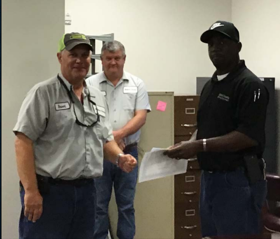
Robert Gentry Highway