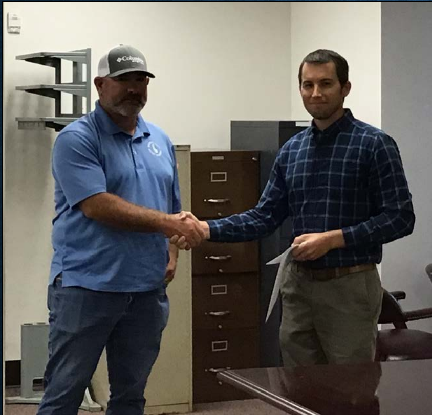
Matthew Ulrich Highway