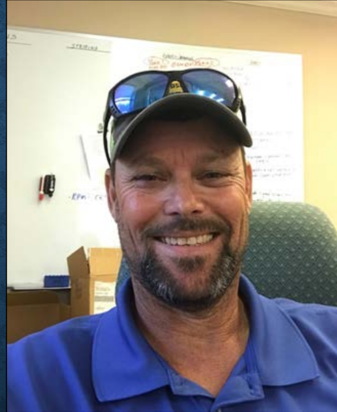
Jeromey Parks Highway