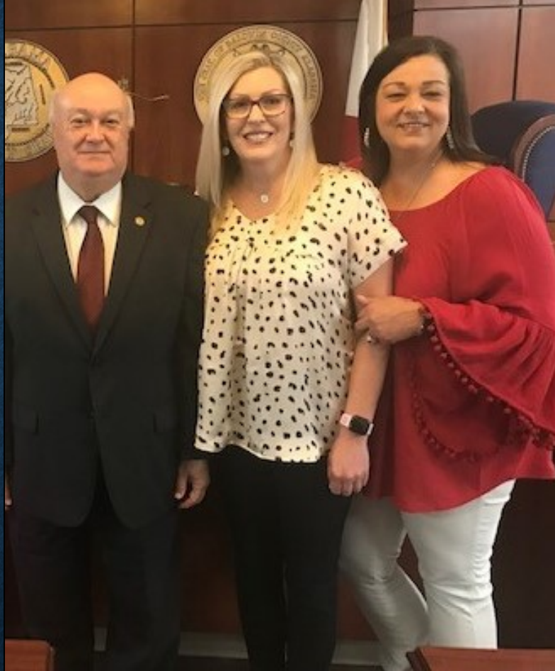
Lynn Day Probate Office