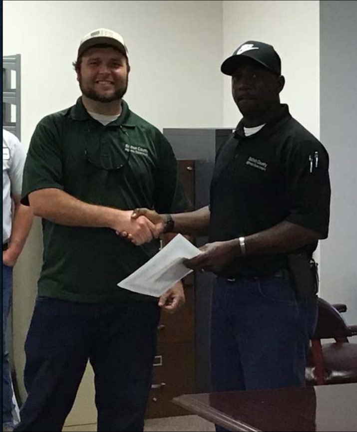
Randy Black Highway