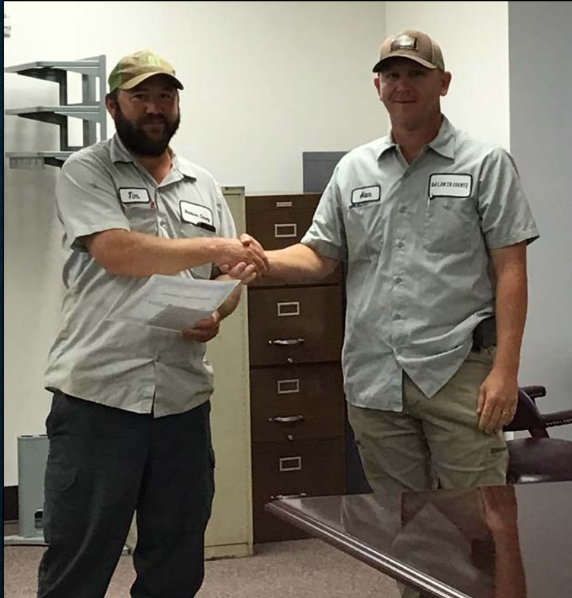
Timothy Butler Highway