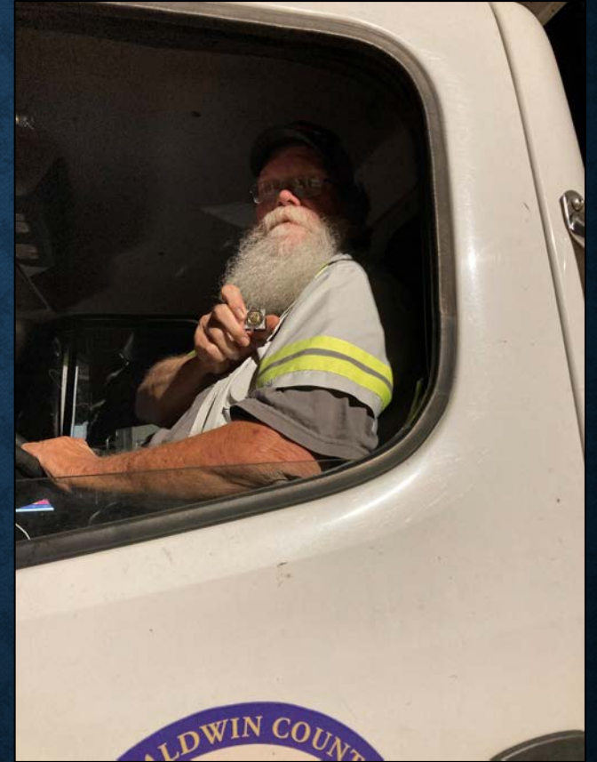
Don Sealy Solid Waste