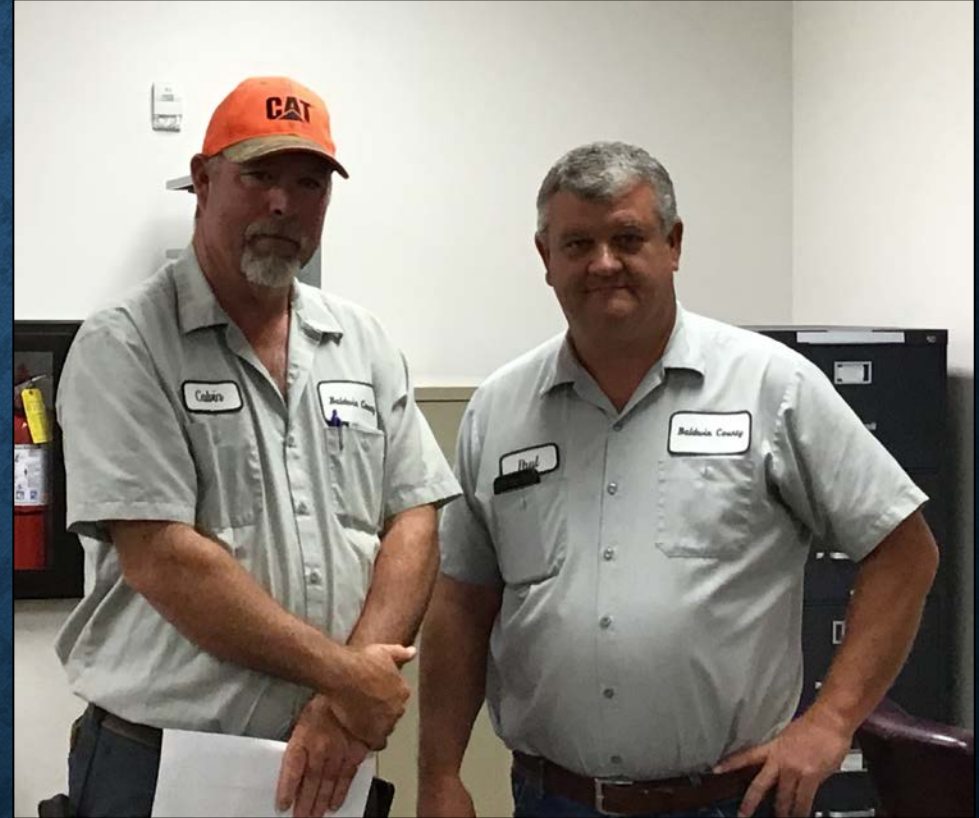
Calvin Glass Highway