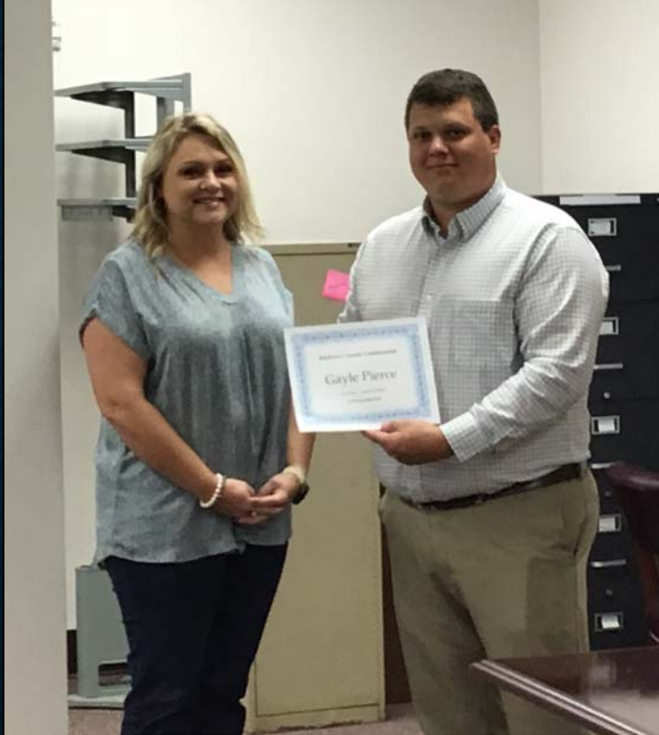
Gayle Pierce Highway