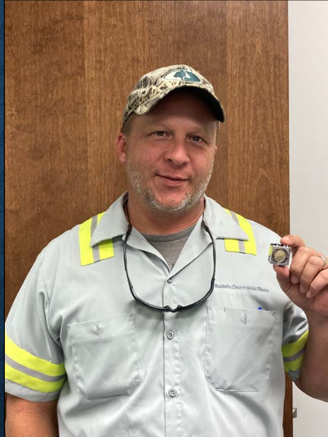
Randall Aaron Solid Waste