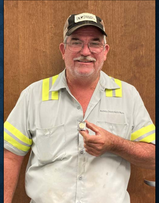
Roy Kelley Solid Waste