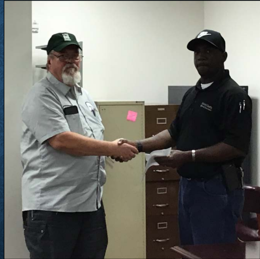
Keith Van Vleet Highway