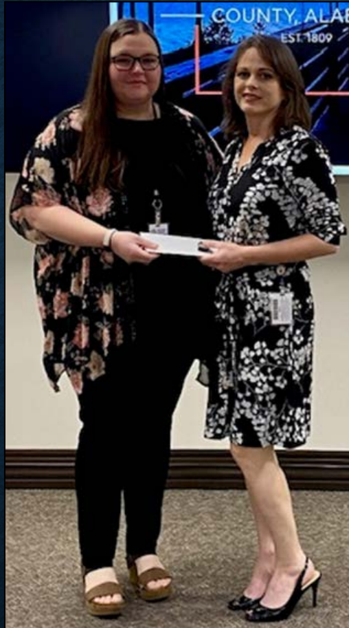
Courtney Etheridge Citizen Service Center