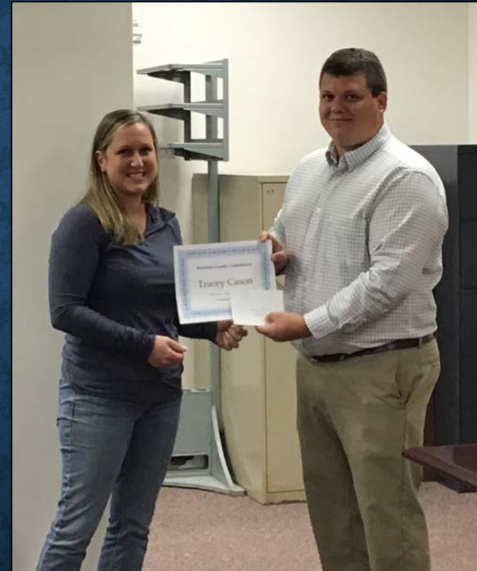
Tracey Cason Highway