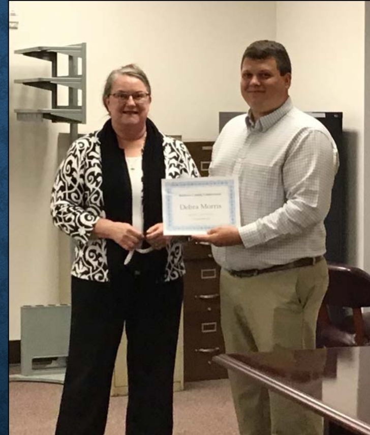
Debra Morris Highway