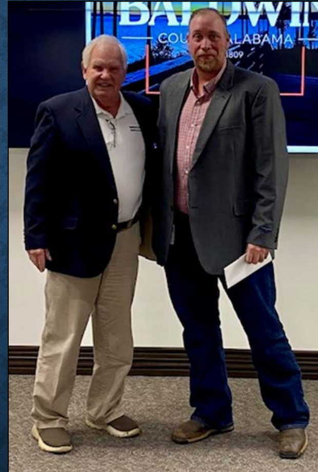
Derrick Crocker Building Maintenance