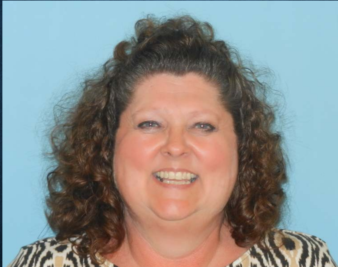
Cami Wheeler Highway