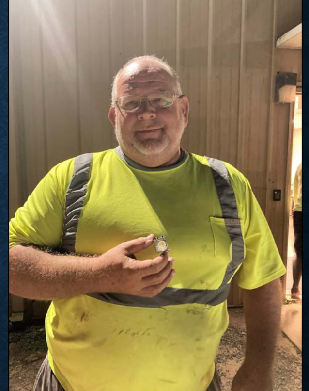
Anthony Nobles Solid Waste